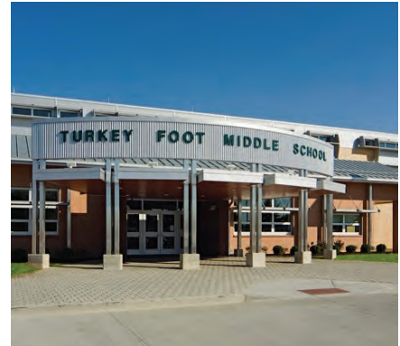
The Turkey Foot Middle School includes many high-performance technological factors to support low-energy.

Sustainable Building Partners is currently providing or has provided consulting services on three projects that are targeting Net Zero. The American Geophysical Union in Washington, DC is targeting LEED Platinum and Net-Zero. SBP is providing LEED Consulting, and Building Commissioning for the American Geophysical Union’s renovation of their building located at 2000 Florida Avenue. SBP is providing energy modeling and consulting services to the design teams for two Virginia Beach City Public School projects currently in the design phase. Both schools are targeting Net-Zero ready through the use of advanced energy efficiency equipment and daylighting to reduce overall energy use.